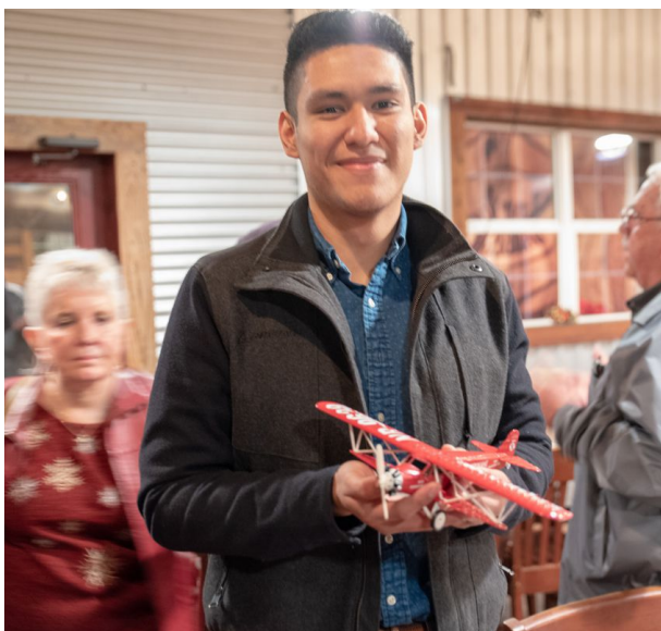
Time to start my collection.