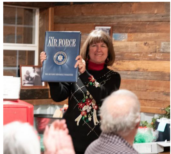
Now I can find out what they really do.