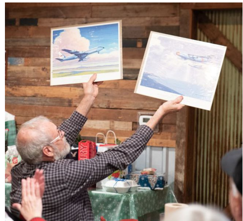
Wow – just what I wanted!