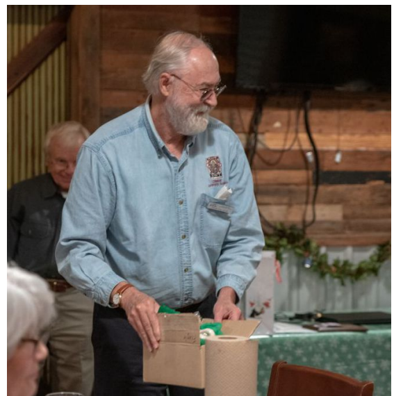
Hmmm – which one looks better?