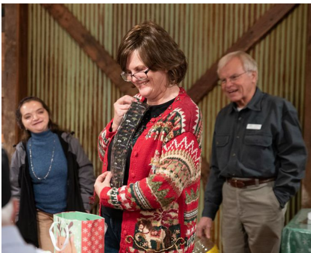
Really – is that me?