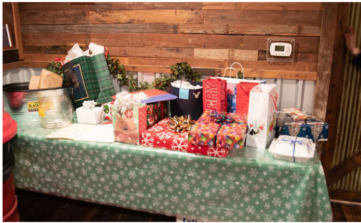
Presents for the “white Elephant” exchange